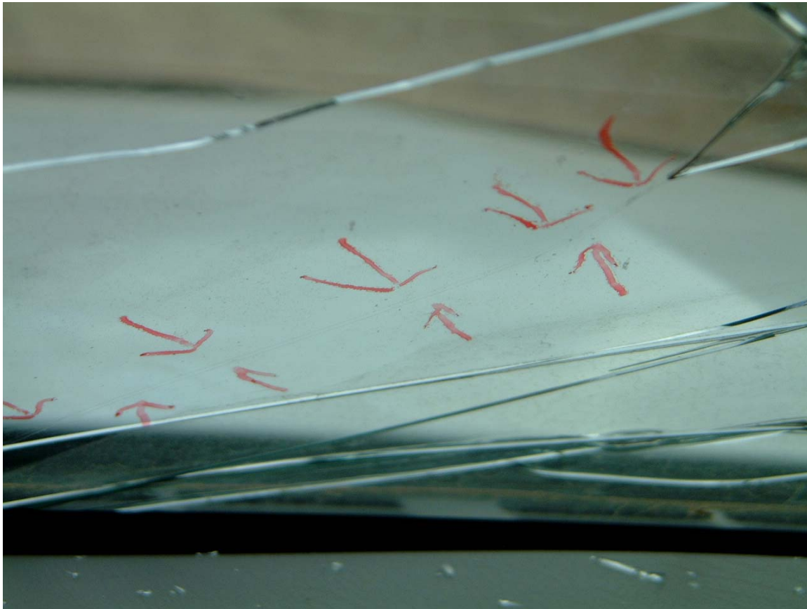
Exhibit A -12 inch crack repair in a rollover accident, still bonded.